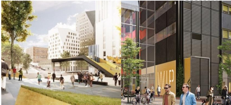
The proposed scheme