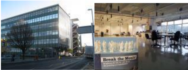
New England House